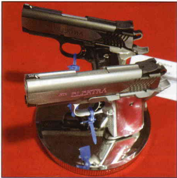
STI's Elektra 1911 models have pink or black pearlescent grips, groove mounted Heinie Straight 8 night sights and stylish slide serrations for a whole lotta "Wow!"