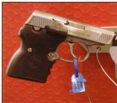
The Crimson Trace for this NAA Guardian .380 is grip integrated.

exactly alike. Santa Fe Sky is a bright azure blue that can sport a black finished cylinder or matte stainless look. They are up to 10 colors in the aluminum framed guns and four in their steel framed models. There will be merch-