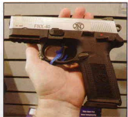
FNH's line of FNX pistols, like this FNX-40 have interchangeable backstraps.

stock that was all the buzz last year, has become more obtainable and now comes in black as well as desert