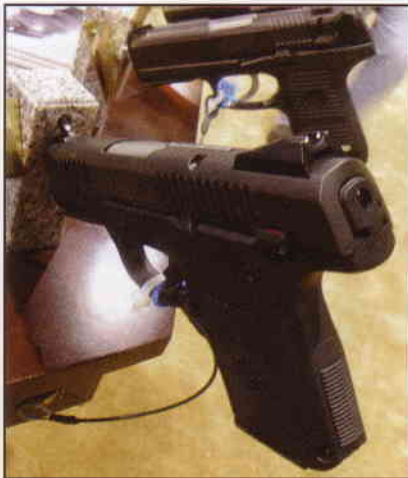
Ruger has re-done the SR9 and come out with a compact version. The trigger is improved while they've kept the undercut grip and reversible backstrap piece for better hand fit.

Rossi, Taurus' companion long gun company, is running with the variety concept in their Wizard rifle frame that will take barrels for 13 popular rifle calibers, shotgun in 12, 20 or 410 gauge, and muzzle loader barrels in .45 and .50 calibers. The barrels change out easily. Each barrel is sold separately so the shooter can customize the wardrobe of barrels to personal preference.